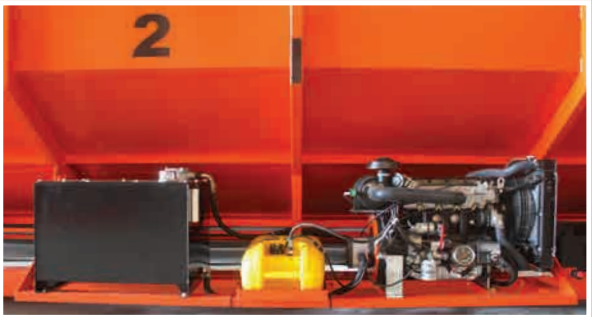
OPTIONAL PETROL OR DIESEL POWER