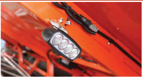
OPTIONAL LIGHT KIT