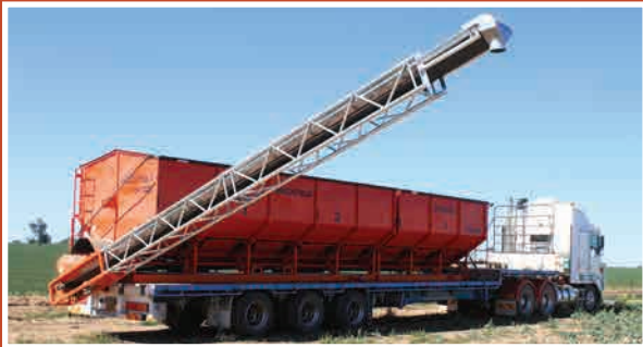
OPTIONAL SIDE CONVEYOR