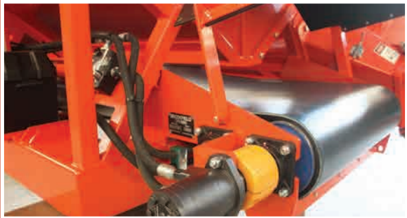
OPTIONAL HYDRAULIC DRIVE