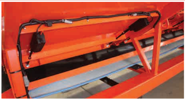
OPTIONAL WIRELESS REMOTE CONTROLLED ELECTRIC DOORS