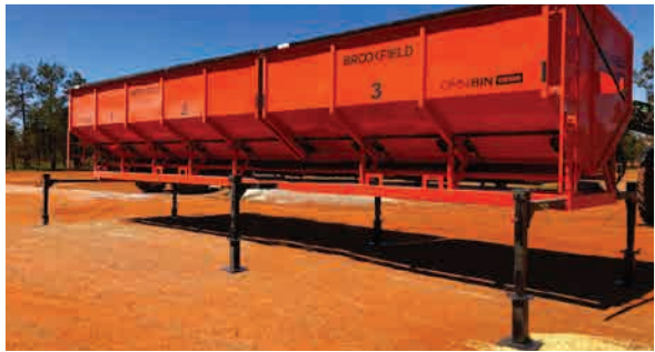
OPTIONAL JACK KIT