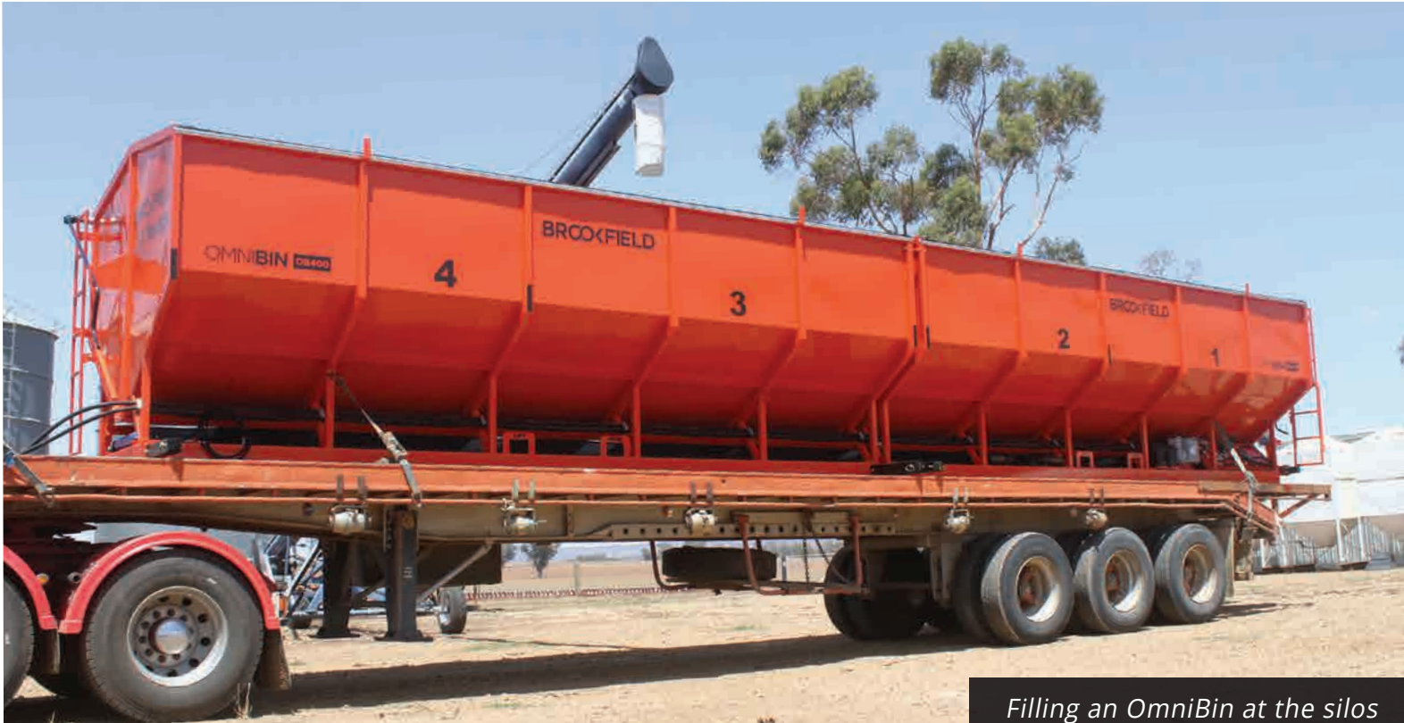
Filling an OmniBin at the silos