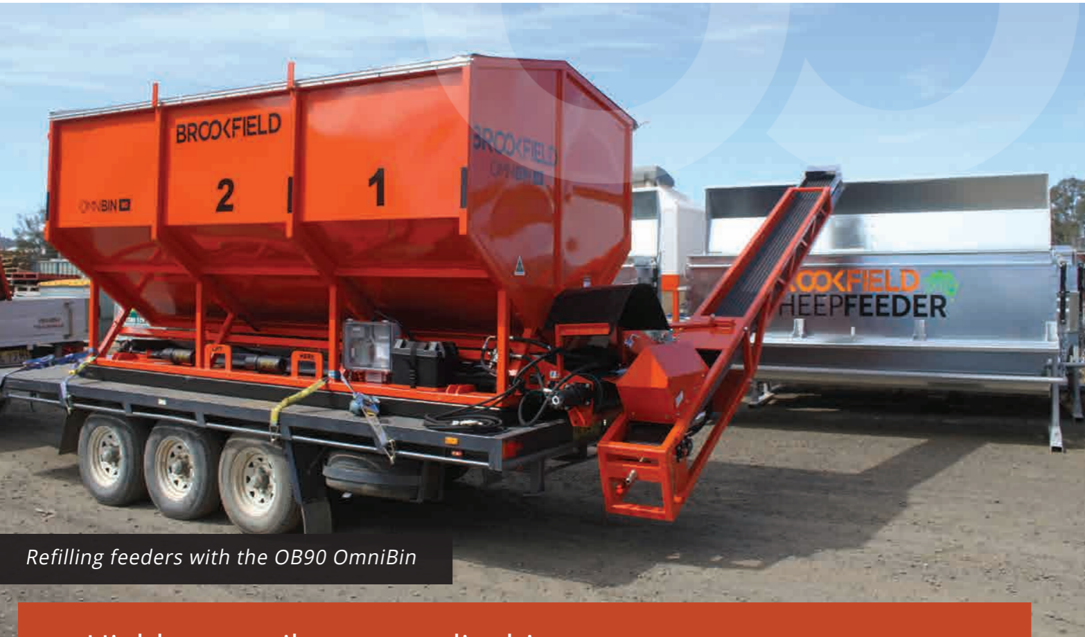
Refilling feeders with the OB90 OmniBin