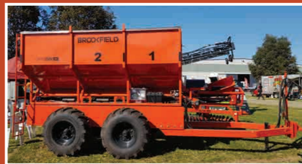
STANDARD FULLY POWDER COATED