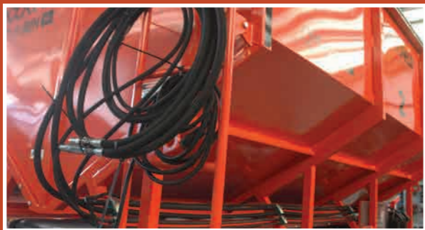
STANDARD HYDRAULIC DRIVE