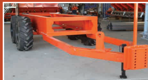
OPTIONAL HEAVY DUTY TRAILER