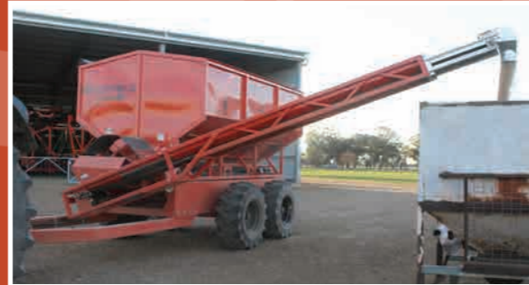
STANDARD 6M SIDE CONVEYOR