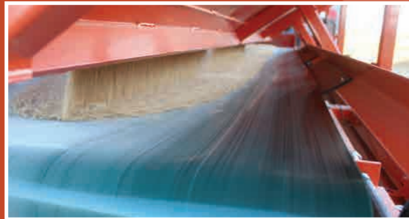
STANDARD FULL LENGTH CONVEYOR