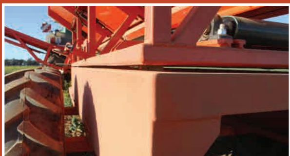
OPTIONAL LOAD CELLS