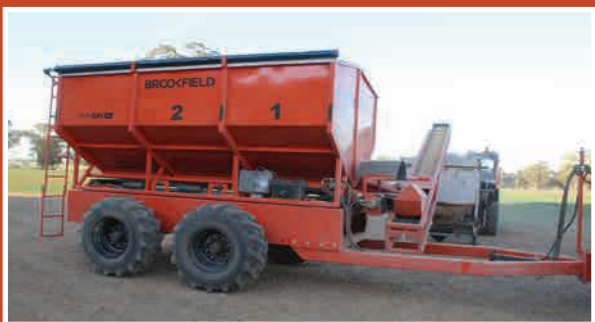
OPTIONAL ROLL TOP TARP