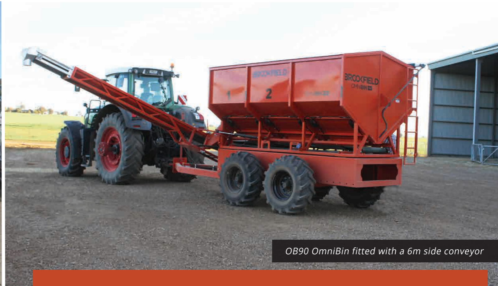
OB90 OmniBin fitted with a 6m side conveyor