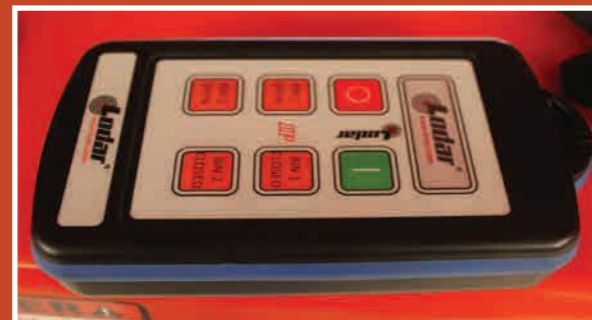
OPTIONAL REMOTE CONTROLLED